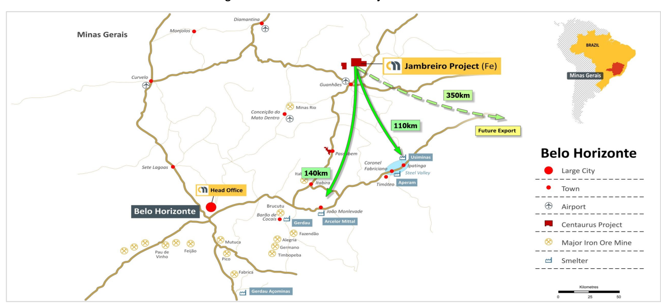
Figure 2: Jambreiro Iron Ore Project Location

The Company's 100%-owned Jambreiro Project, located in south-east Brazil (Figure 2) close to the Company's head office in the city of Belo Horizonte.