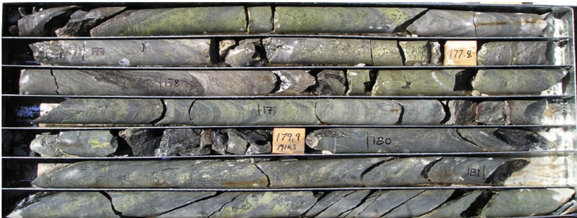
Figure 2: Photograph of diamond core from hole MTD 2 showing semi-massive chalcopyrite mineralization at top of figure.